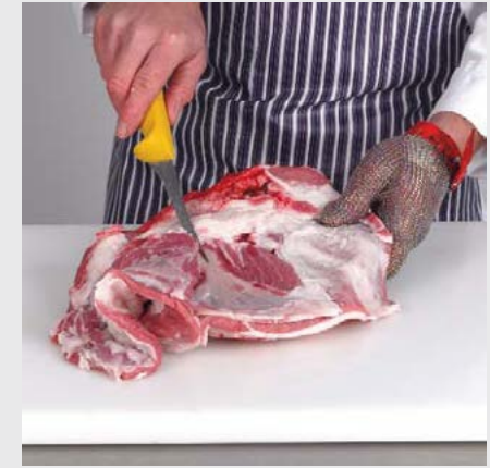
4. Carefully remove blade and shoulder bones.