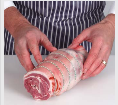
8. Boned and rolled shoulder, ready for sale.