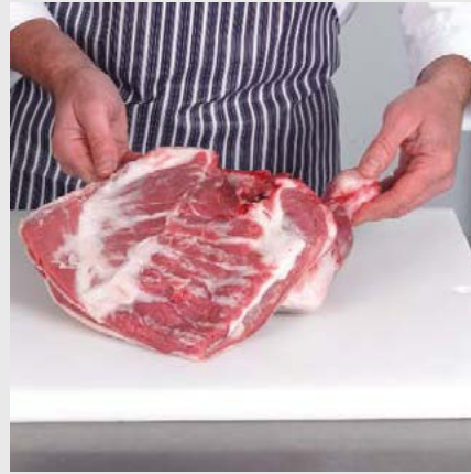
2. Shoulder of lamb.