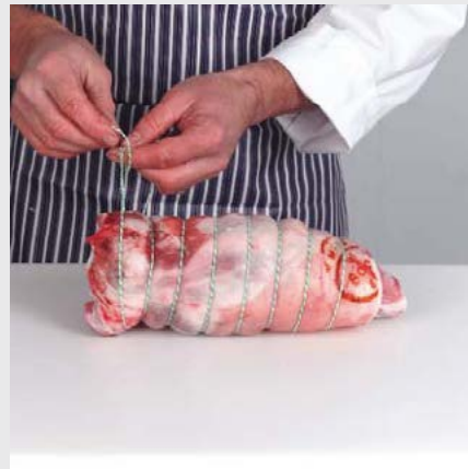
6. Roll and tie joint securely with string at regular intervals.