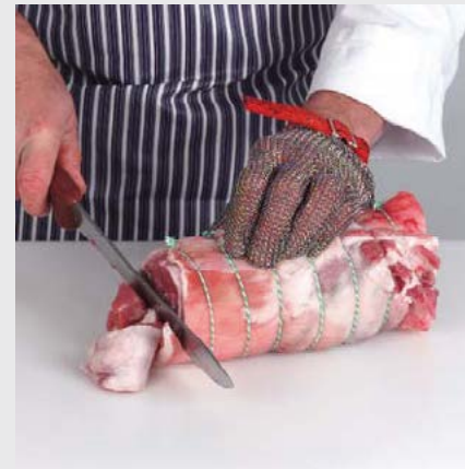
7. Trim both ends.