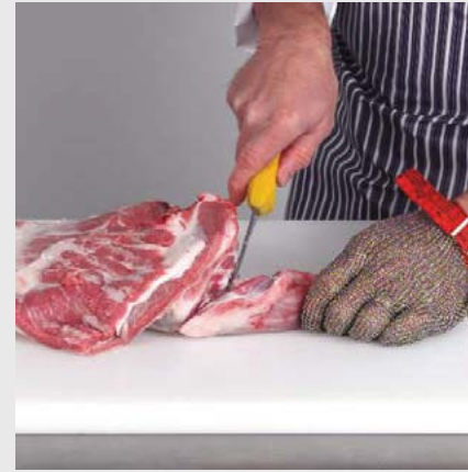
3. Remove knuckle by cutting through the joint.