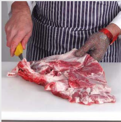
5. Remove excess fat deposits.